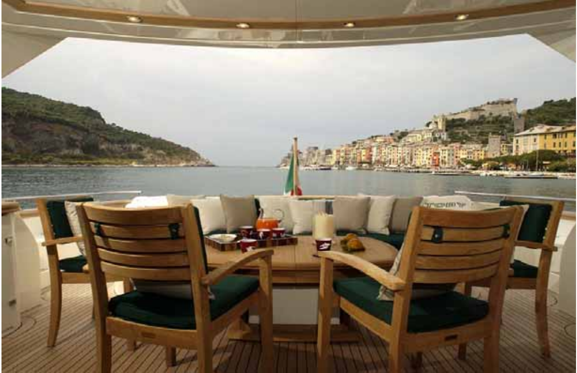
Superb deck areas