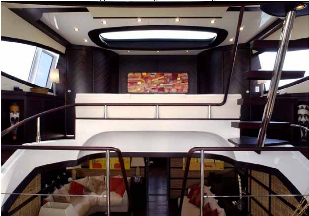
View when entering from aft deck Main salon and upper lounge