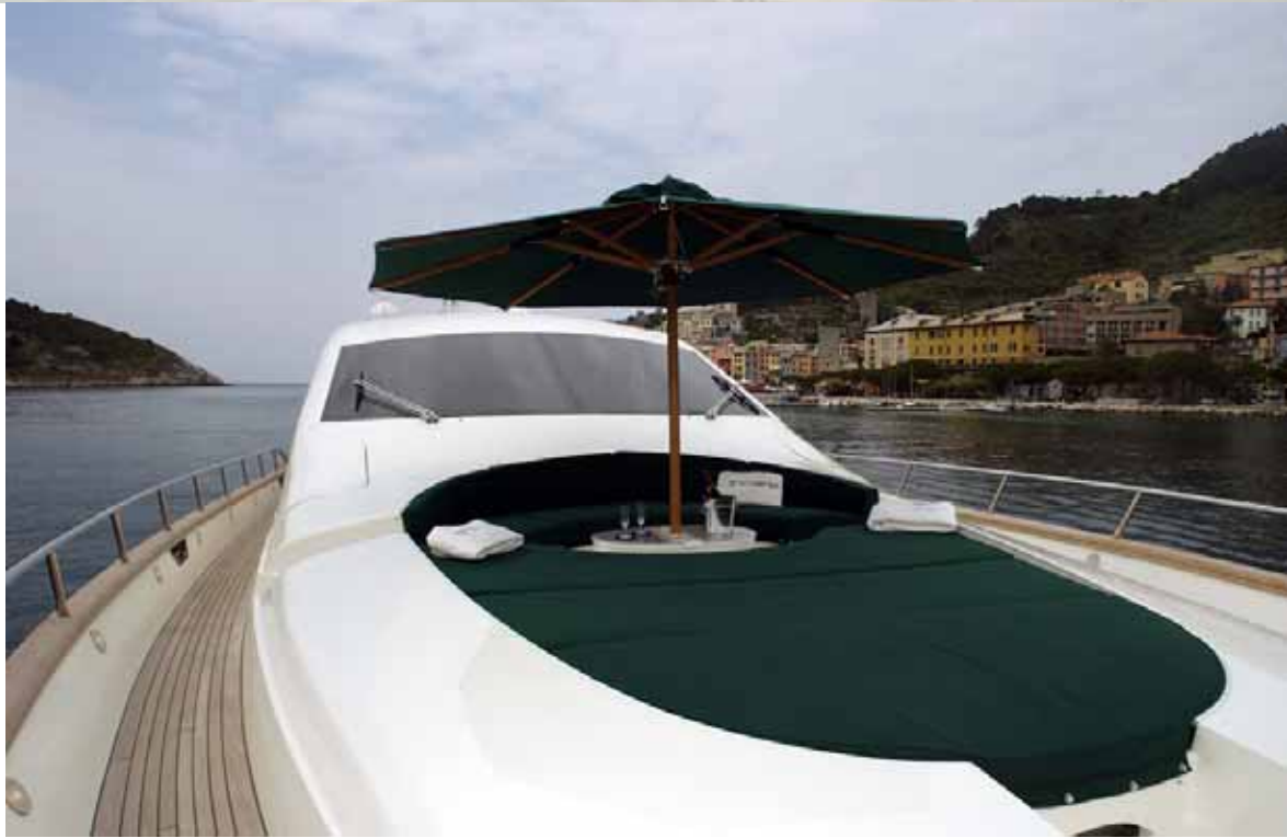
Bow dining Sun bathing area