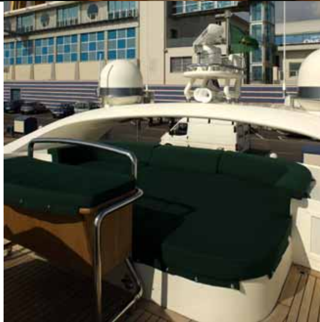
Dining al fresco & Fly bridge pilot