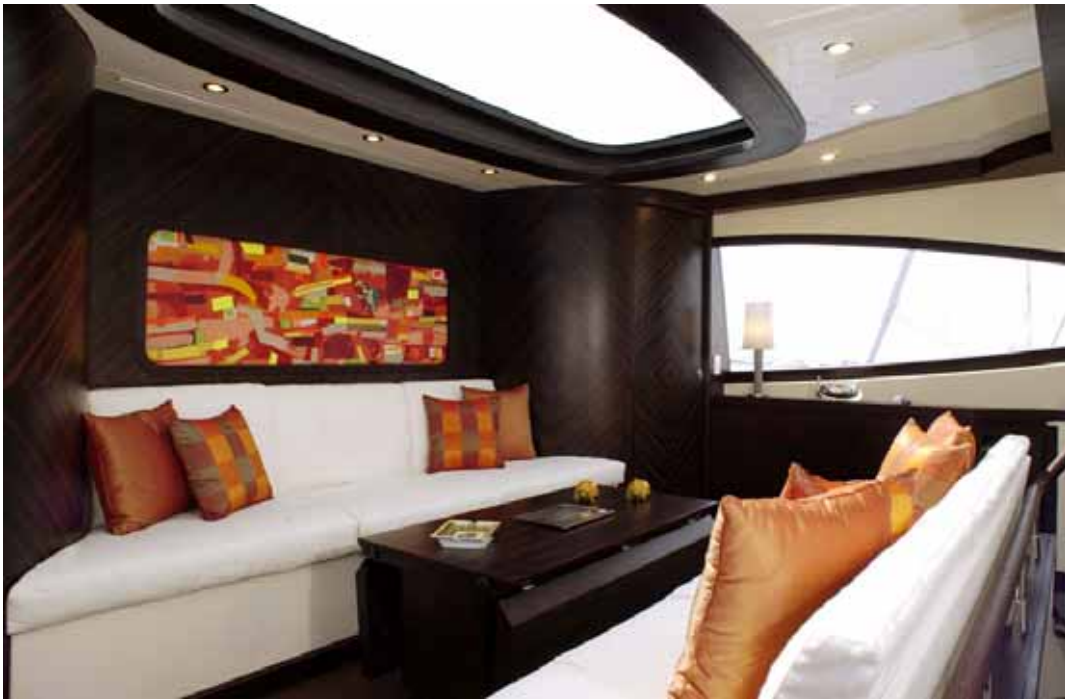
Upper salon / lounge / Formal Dining